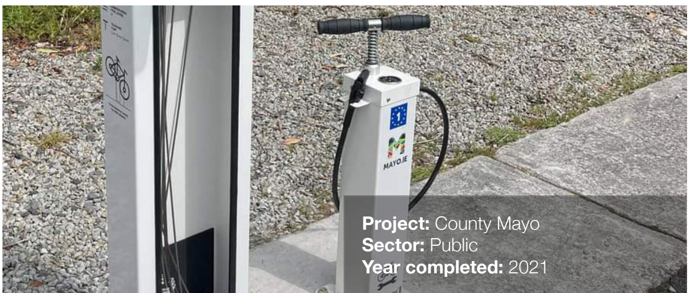
Project: County Mayo Sector: Public Year completed: 2021