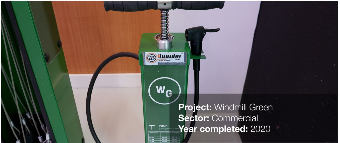
Project: Windmill Green Sector: Commercial Year completed: 2020