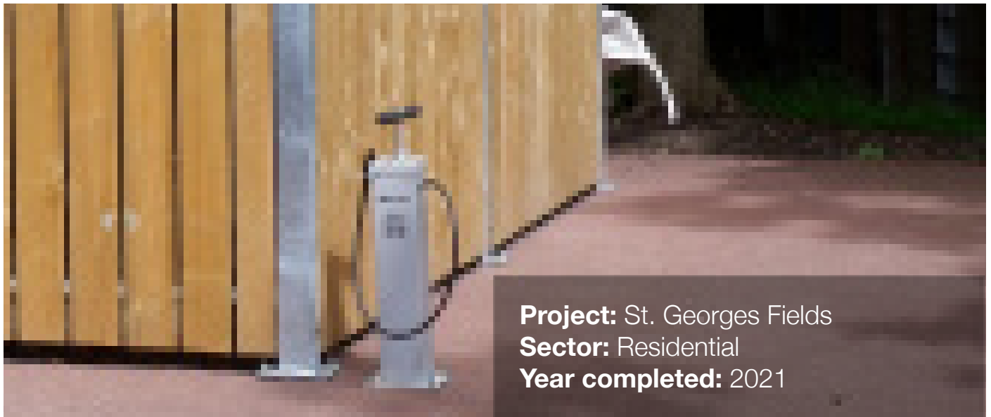
Project: St. Georges Fields Sector: Residential Year completed: 2021