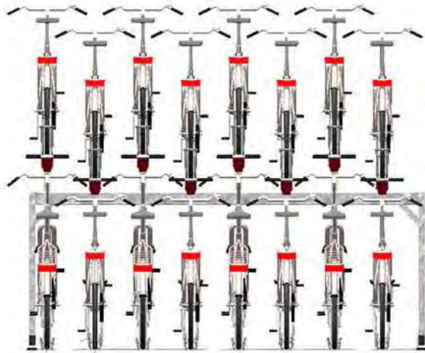
Single sided staggered layout